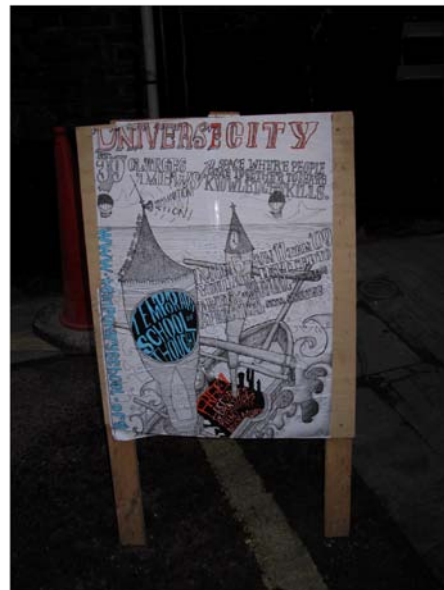
Fig 6. Temporary School of Thought street sign.