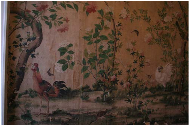
Fig 4. Detail of the Chinese wallpaper.

But let us begin with the house, a Georgian terraced house on a side-street to Berkeley Square, an area with some of the highest property values in London (and thus perhaps in the world). Built on speculation c. 1750-53, without the aid of an architect, it is an anonymous token for the taste and the building techniques of its time. Today, the house carries a Grade