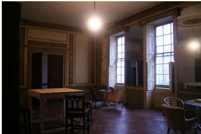
Fig 18. Living room.