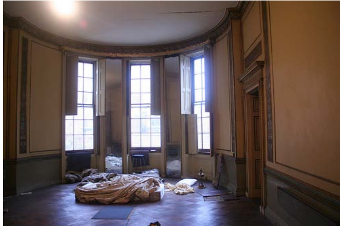
Fig 16. Bed room.

human co-existence with mixed and incidental contacts, rather than that of isolation and separation on which a modern subjectivity is based.