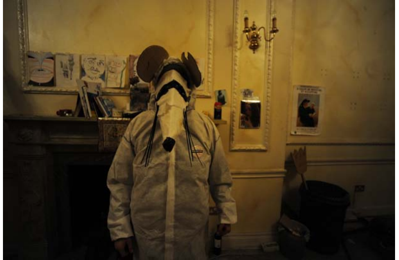
Fig. 14. Person dressed up as a mouse.