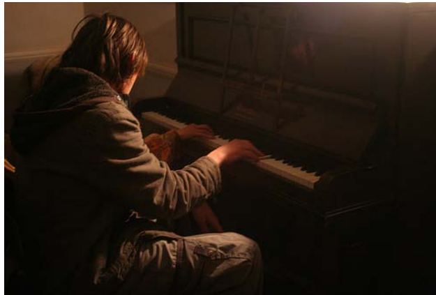
Fig. 20. Piano lesson.