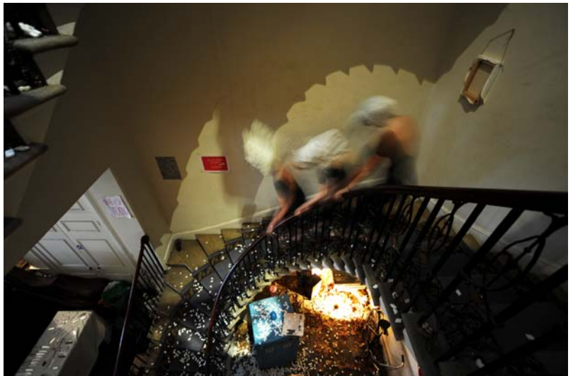
Fig. 15. Performance in the staircase.

Given the setting and social history of the house, however, it might be argued that the squat had more akin to restoration than to revolt. In terms of resistance, it was certainly different from, say, the riots in the suburbs of Paris in 2005. The house had been planned for a display of spectacle; the story about the ponies in the first floor reception room shows how a certain eccentricity was maintained well into the twentieth century. Wedging themselves closely to the original ethos of the house, the collective's staging of activities (which included fancy-dress parties and productions of Dorian Grey ) held an evident allusion to the building's past. Play may be seen as a particular form of resistance, not one that operates in the face of power – distorting codes, values and uses in a direct and oppositional way – but working at a more insidious level, through ways of doing and forms of expression that are not 'for real' but enacted as if they were. 33 The playful and narcissistic aspects of the collective's enterprises (such as their willingness to pose for photographers), in combination with their