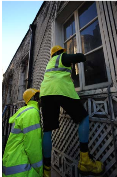
Fig 5. Getting inside (re-enactment).

II listing and its assumed market value of £22.5m circulated incessantly in the press during the occupation. By present standards No. 39 Charles Street is considered 'remarkable', not least because of the so-called Chinese room with eighteenth century hand painted wallpaper – a room the squatters conscientiously kept locked. The conflicts concerning the value of this building is a text book example of the distinction between exchange and use value – an object of financial investment vis-à-vis an open free space – but is also a case in point for how shifts in use set forward alternative meanings and experiences.