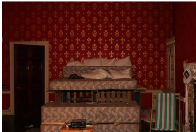
Fig 17. Lecture hall.