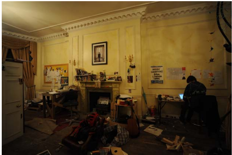
Fig. 8. The studio.