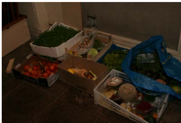
Fig 21. Freegan food.