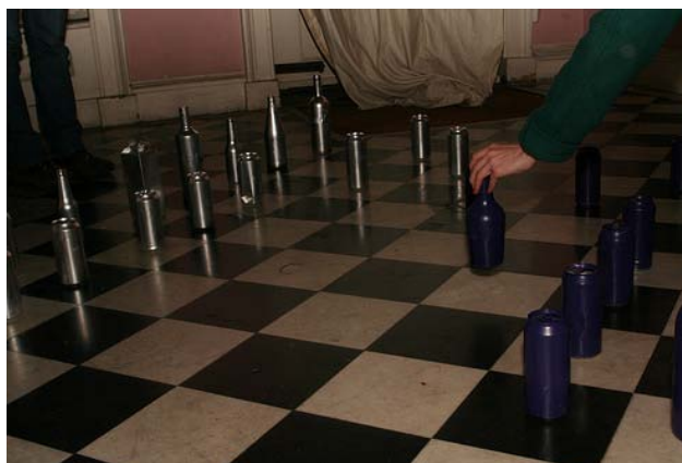
Fig. 19. Foyer chess.