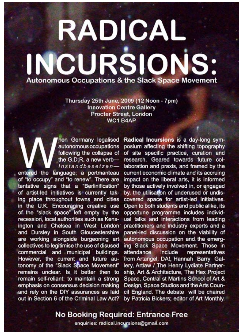
Fig 10. “Radical Incursions” invitation

Nevertheless, it was due to its slackness that the house in Mayfair was possible to squat; was singled out by activists who strategically moved about in search for optimal conditions. Used to promote a fundamental compliance with economical forces, as well as anti-capitalistic resistance, the indecisive ideological status of slack space runs parallel to that of squatting. Although it is “largely absent from policy and academic debate [and] rarely conceptualised, as a problem, as a symptom, or as a social or housing movement”, urban squatting in a Western context is generally seen to straddle between opposite poles – motivated by life-style choices on the one side, by material needs and ‘the struggle for one’s daily bread’ on the other. 23 Squatting still has a remarkable strong position in the British system. Its legal foundations stretching as far back as to The Forcible Entry Act of 1381, to occupy a building without permission of the owner is not a criminal act: unlawful, but not illegal, according to the Squatters Handbook 24 (now in its 13th edition). Based on the ancient