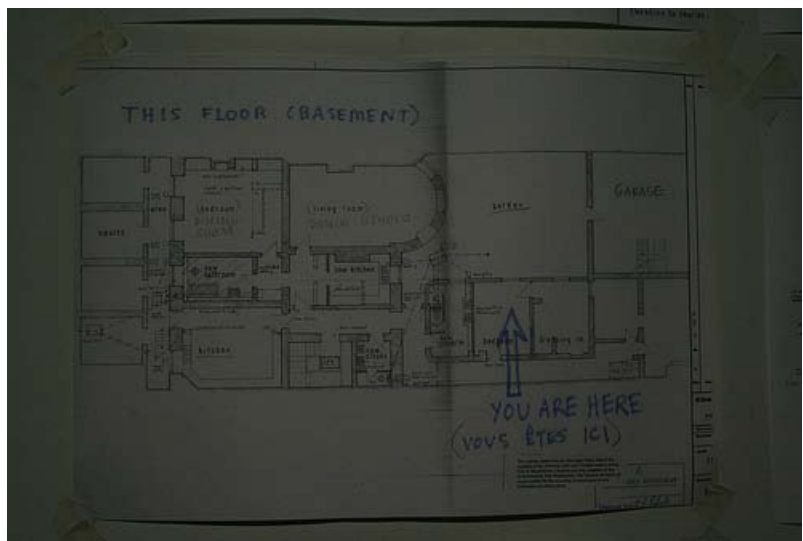
Fig. 13. Floor plan of Charles Street.

In its abandoned state, the house in Mayfair was possible to claim for other purposes. Its appropriation by DA! collective brought about a blurring of categories: between exchange and use value, between different forms of ownership, between private and public – it produced a multitude of sites and narratives. The house at Charles Street proved to be exceptionally adequate for sustaining such shifts. Characterised by duality (a Front and a Back; an Upstairs and a Downstairs) and providing a choice of rooms unspecified as to their present use, it allowed for a life-style of comings-and-goings and the multi-programmed array of activities that characterised the Temporary School of Thought. Functions were mapped on plans provided by the council and distributed spatially according to logistics and physical conditions. The reception rooms on the first floor were fitted with rudimental seating and accretions for screenings and a small reception was set up by the entrance from the mews, complete with hosts welcoming visitors.