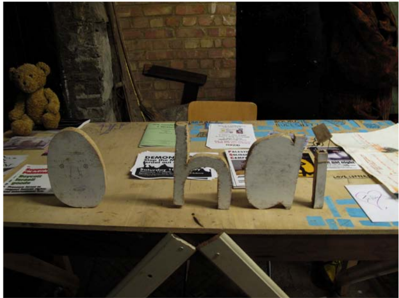
Fig 7. The reception desk.