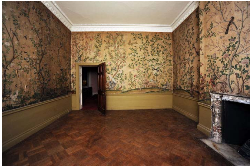
Fig 3. The Chinese Room.