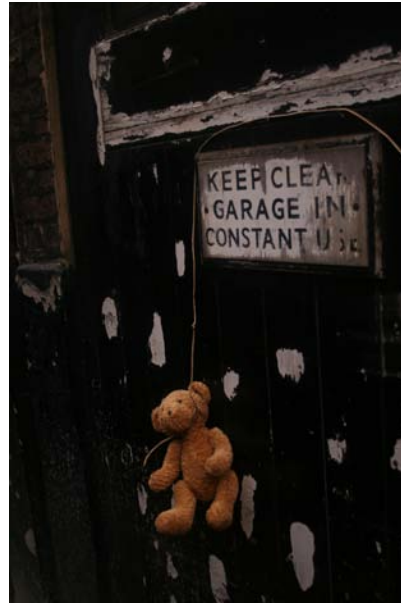
Fig. 22. Hung teddy (eviction).

Clearly, the appropriation of a building built for other purposes is imbued with notions of freedom. Jim wrote: