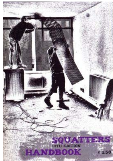
Fig 12. The Squatter’s Handbook. (cover)

The theory and practice of squatting disclose it as an intensely real entwinement of time, space and human agency. While the Forcible Entry Act continues to protect squatters from being evicted by force (made manifest by Section 6 of the Criminal Law Act, accessible for downloading in a friendly print-out format), by equally ancient ‘common law’ squatters may obtain legal ownership to a house providing their occupancy remains uncontested for 12 years. 29 But such conditions are hard to fulfil, and recent changes in the law designed for the protection of private ownership have added to the hardships of squatting. There are agencies for squatting 30 in London – places that provide legal advice and offer practical information on how to come to terms with basic amenities such as water, electricity and sanitation. 31 Squatting is, to a large extent, learnt thorough a ‘sharing of skills’ where experienced squatters support and initiate younger players to the game. The ethical codex to improve the house, not to destroy it (as conveyed through the Berlin expression Instandbesetzen – a combination of Instandsetzen : to put in order, and Besetzen : to possess or occupy) gives squatting a precarious position vis-à-vis the architectural discipline. Epitomising the figure of the ‘active user’, the squatter appropriates and transforms existing spaces according to his or her needs and ideas – a heuristic discoverer, inventor and creator of architecture through the autonomous thrust of DIY.