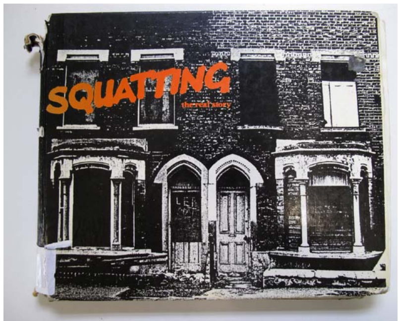
Fig 11. Squatting: the Real Story. (cover)

right of obtaining possession through use, thorough spatial practice sustained over time, squatting may be seen as "the oldest mode of tenure in the world". 25 Its British history is long and politicised, epitomised by the Diggers and the Levellers who in response to the intense land privatizations during the seventeenth century invaded private land and enjoyed a short-lived success by "sowing the ground with parsnips, carrots and beans, with the intention of restoring 'the ancient community of enjoying the fruits of the earth'". 26 As a mode of claiming space through occupancy, however, squatting was always a two-sided phenomenon. Not only did it allow for the medieval poor to settle on wasteland and take over deserted holdings, but it also enabled estate owners in their expansion of territory by fencing in common ground for pasture. 27 After the ideologically inspired wave of urban squatting in the 60's and 70's, and following the largely de-politicised climate since, squatting today is said to have ceased to operate as a collective mobilising force. Current research sees it as a multifaceted phenomenon fraught with ideological tensions, verging between quaint bohemian institutionalisation (in close alignment to artists' roles in gentrification processes) – and a form of anarchistic 'direct action' in confrontation to private property. 28