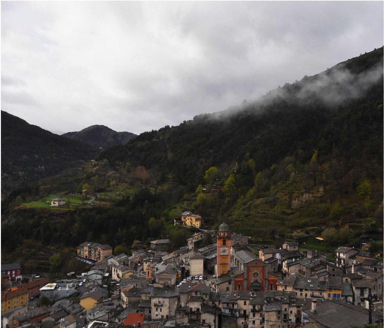
Figure 1 Vallée de la Roya. View over Tende.