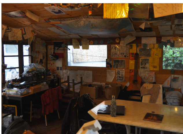
Figure 5 The common area, full of decoration, drawings and memories left by former inhabitants and volunteers in the Camping