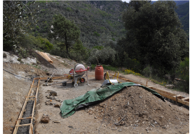
Figure 7 Volunteer workshop for the reconstruction of a burned henhouse