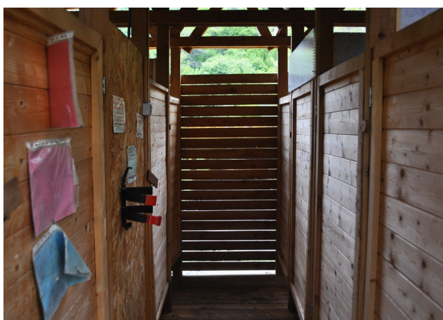
Figure 4 Dry toilets and showers installed on the farm

Soon the site started to represent a point of reference for those wishing to help people in transit in the valley. The site, labelled 'Le Camping' or 'Le Camp', was completely self-sufficient and managed by the farmer, volunteers living in the valley, or those coming from the neighbouring territories, as well as the people welcomed who actively took part in the self-management of the shelter. Various associations started to assist in place, providing legal aid, French language courses, artistic ateliers, and medical aid to the vulnerable people, managed by Médecins du Monde. Around 2,500 persons have been hosted on the farm since 2015, with peaks of arrivals in the summer of 2017. The farm was also one of the most emblematic case of the intense militarisation and control by law enforcement in the valley: the strong mediatisation of the figure of Cedric Herrou and the importance that his farm acquired in the valley as the main space of reception led to remarkable police pressure in close proximity of the site, with up to five police checkpoints surveilling 24/7 at one point. The constant militarisation of the farm has highly contributed to the general decrease of people transiting in the valley, significantly reducing numbers in the shelter.