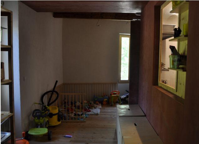
Figure 6 A common area in La Tuilerie with a large kitchen, sofas, toys, etc.