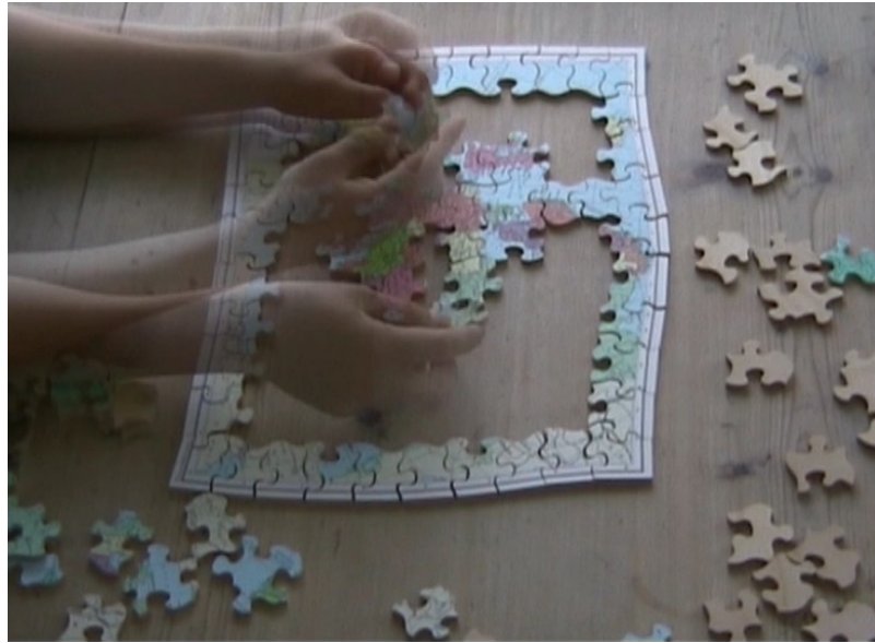
Fig. 1. Film stills from Remote Worlds in Four Parts (R. Tyszczuk, dv, 12 mins, 2004). In Georges Perec's La Vie mode d'emploi ; Life a User's Manual: Fictions , trans. David Bellos (London: Vintage, 2003), the main character Percival Bartlebooth spends his life making and unmaking puzzles.