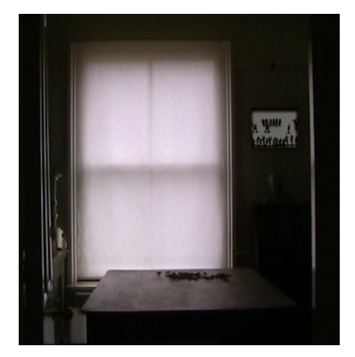
Fig. 4. Film still from Remote Worlds in Four Parts (R.Tyszczuk, dv, 12 mins, 2004).

It is is only scratching the surface, as what I would include in the term 'architectural practice' is purposefully heterogeneous. See, for example, Doina Petrescu (ed.) Altering Practices: Feminist Politics and Poetics of Space (London: Routledge, 2007); and the Alternate Currents Symposium at the University of Sheffield, 2007, field (2) 1, 2008 (forthcoming).