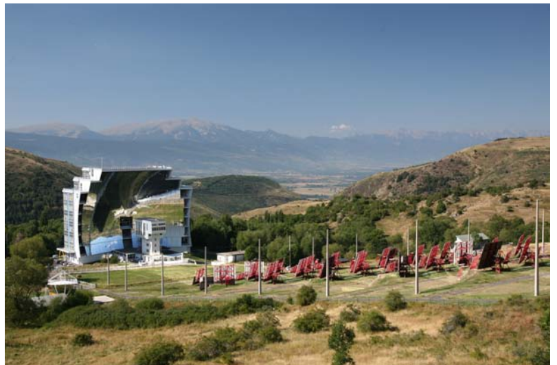
Fig 5. The Félix Trombe Solar Furnace, Odeillo-Font Romeu, France, 2010.

Facing the parabolic mirror of Mont Louis, I put myself in the picture — an English middle class male in France with a digital camera, my image split into a double mosaic of mirrored reflections rendered in pixel form.