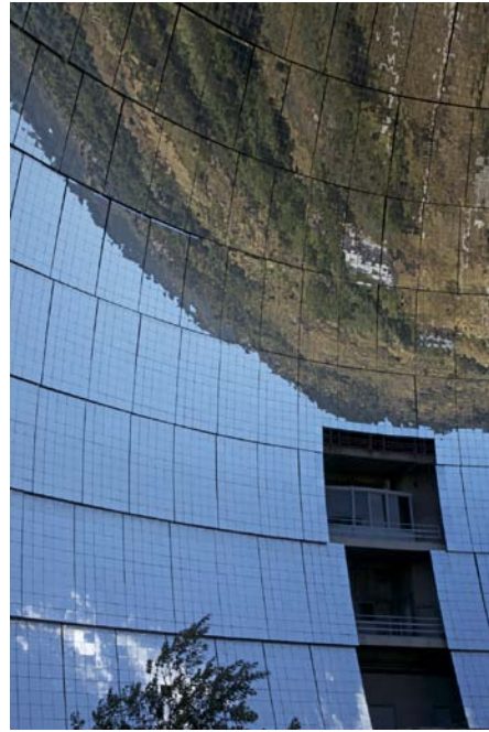
Parabolic reflector and viewing gallery of the solar furnace, Odeillo, France, 2010.

In the clear sunlight of the mountains, the space-age symbolism of the solar furnace seemed to intensify: this building proclaims that science funded by the state and conducted in the public interest (if not actually under democratic control) is not a utopian fantasy to be dismissed as part of the demise of Modernism.