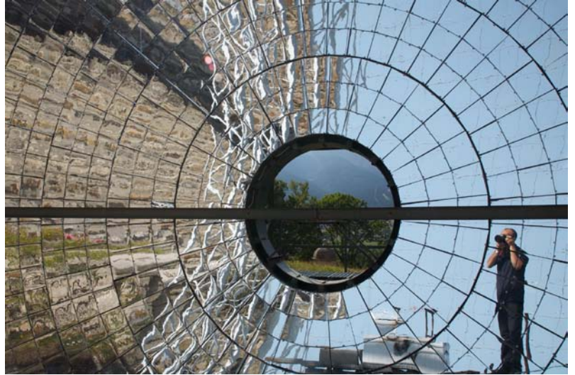
Fig 4. Self-portrait with parabolic reflector. Solar Furnace, Mont Louis, France, 2010.

I love these solar mirrors, though I have to concede that while all technologies are grounded within social relations, none is inherently liberating. Equally, I am seduced by the notion that the camera has the potential to transform thought; though I suspect that within consumer culture, photography is constrained instead to endlessly nuance received ideas.