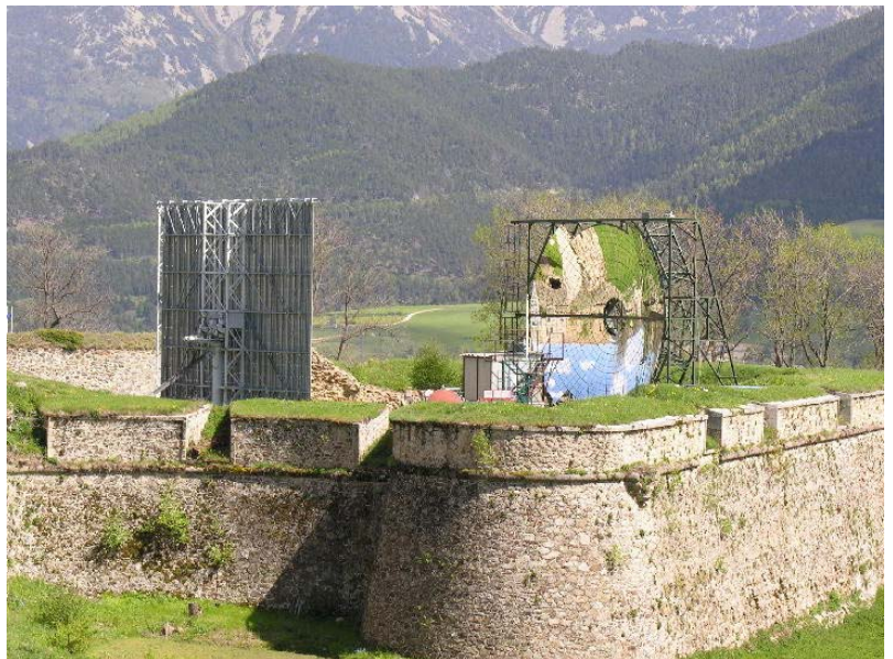
Fig 2. Solar Furnace, Mont Louis, France, 2009.

Similarly, the camera itself records an image of the optical processes of reflection, focus and exposure without acknowledging its own relationship to the situation. Yet this photograph is clearly staged and carefully composed to combine the functions of factual document and publicity image. Already separated from the mesmerizing scene by the passage of time, the viewer is positioned by the photograph as a detached spectator rather than someone who might affect, or be affected by the event.