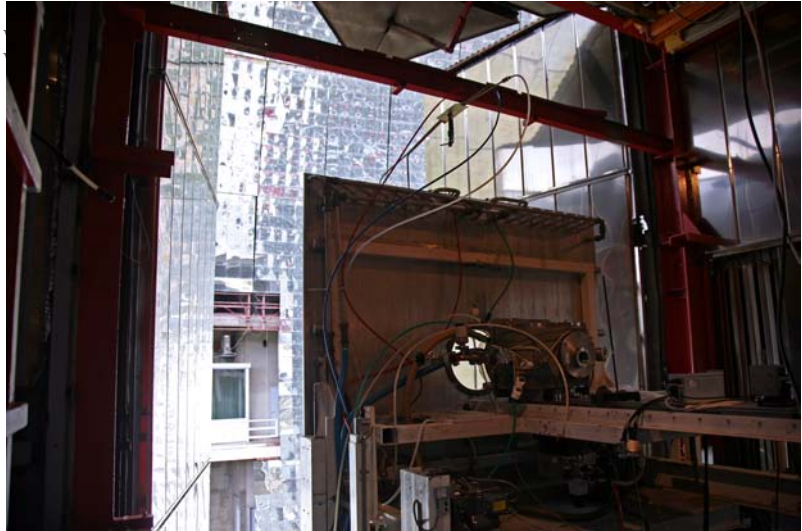
Fig 14. Focal point of the solar furnace, Odeillo, France, 2010.

This digital photograph has been manipulated to reduce the contrast between light levels inside and outside, and to show the detail in both shadow and highlight. It shows the view from the solar furnace tower at Odeillo, looking outwards to the parabolic reflector. In a crucible fixed at the circular opening in the screen, scientists subject materials to ultra high temperatures to test their transformation or destruction.