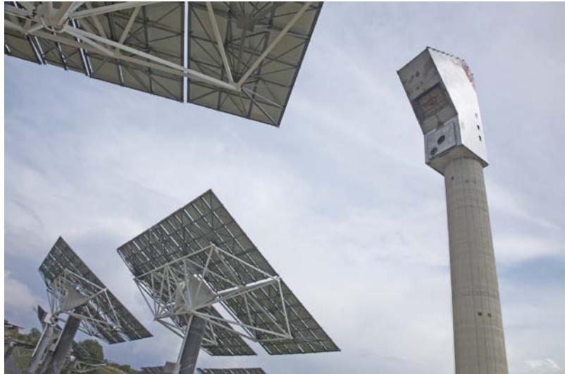
Fig 11. Heliostats facing the collector tower. Thémis centre, Targassone, France, 2010.

Fortunately, the decision to destroy Thémis was deferred: although the centre was designed to collect energy by concentrating the image of the sun, by realigning its mirrors to concentrate starlight and electromagnetic radiation it could double as an observatory. An international group of astrophysicists and scientists with the Commissariat à l'Énergie Atomique, CAE (Atomic energy Commission) and the Conseil Européen pour la Recherche Nucléaire, CERN (European Council for Nuclear Research) successfully bid to use the giant apparatus as a space telescope. This capacity for reorientation from day to night, from visible to invisible, saved Thémis long enough for a consortium of partners to be gathered who are now preparing to reinstate it as a power station and centre for research and development on solar energy.