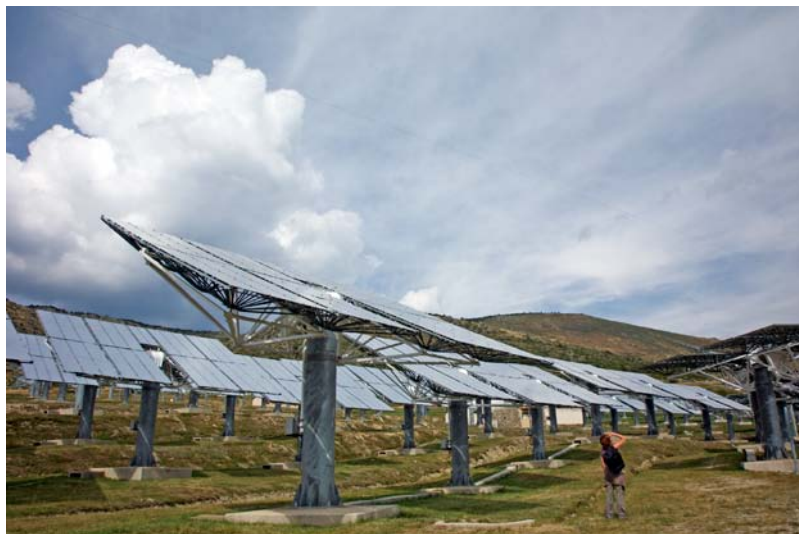
Heliostats of the Thémis centre, Targassone, France, 2010.

Fortunately, the decision to destroy Thémis was deferred: although the centre was designed to collect energy by concentrating the image of the sun, by realigning its mirrors to concentrate starlight and electromagnetic radiation it could double as an observatory. An international group of astrophysicists and scientists with the Commissariat à l'Énergie Atomique, CAE (Atomic energy Commission) and the Conseil Européen pour la Recherche Nucléaire, CERN (European Council for Nuclear Research) successfully bid to use the giant apparatus as a space telescope. This capacity for reorientation from day to night, from visible to invisible, saved Thémis long enough for a consortium of partners to be gathered who are now preparing to reinstate it as a power station and centre for research and development on solar energy.