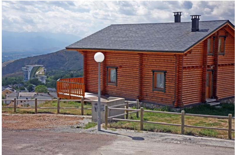
Fig 8. View overlooking Odeillo from Font Romeu, France, 2010.

From up on the hill, I saw the solar furnace juxtaposed with a log cabin. This reminded me of Andrzej Tarkovsky's film Solaris (1972), in which the timber house in the forest represents a connection with the earth that serves as a counterpoint to the disembodied experience of space travel. If chalets like the one in this photograph are constructed with sustainably grown timber and are well insulated, then their individual ecological impact should be far less than their conventional equivalents. But while the space age Solar Furnace is organized around a central principle of focus and concentration, the late growth of suburbs on the hillsides is driven by a private impulse of dispersal and isolation.