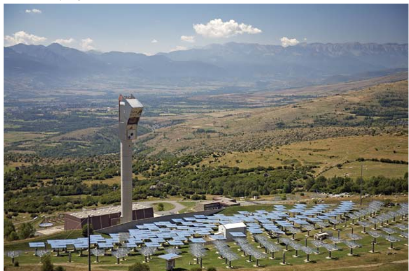
Fig 9. Thémis solar power station. Targassone, France, 2010.

Here, ecological style masks a deep dependency on the motorcar, the road network and the oil well: the timber building is an image, a screen to hide the underlying structure.