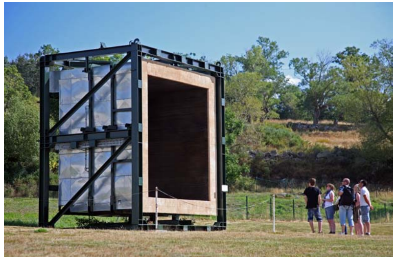
Fig 13. The heat collector from Thémis exhibited in the grounds of the solar furnace at Odeillo, France, 2010.

Whereas fossil and nuclear fuels made it possible to instigate the standardized, 'international style' of globalization, a new modernity based on renewable energy would have to respond to geology, landscape and the 'bioregional' variations of vegetation and climate. When material conditions reassert the primacy of geographic difference, what might be the effect on cultural difference?