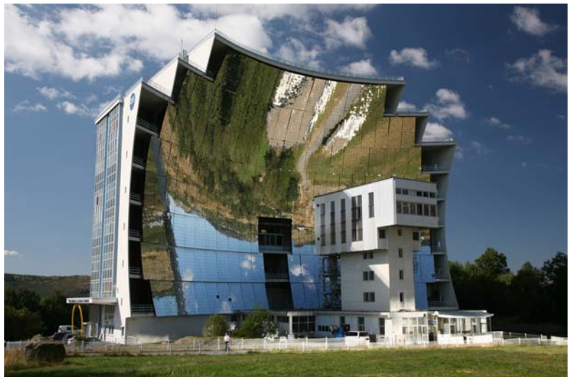
Fig 6. The Félix Trombe Solar Furnace, Odeillo-Font Romeu, France, 2010.

To take this photograph showing the parabolic reflector facing its bank of heliostat mirrors, I used a standard lens and held the camera at eye level from a position beside the road, created specifically as a vantage point for tourists.