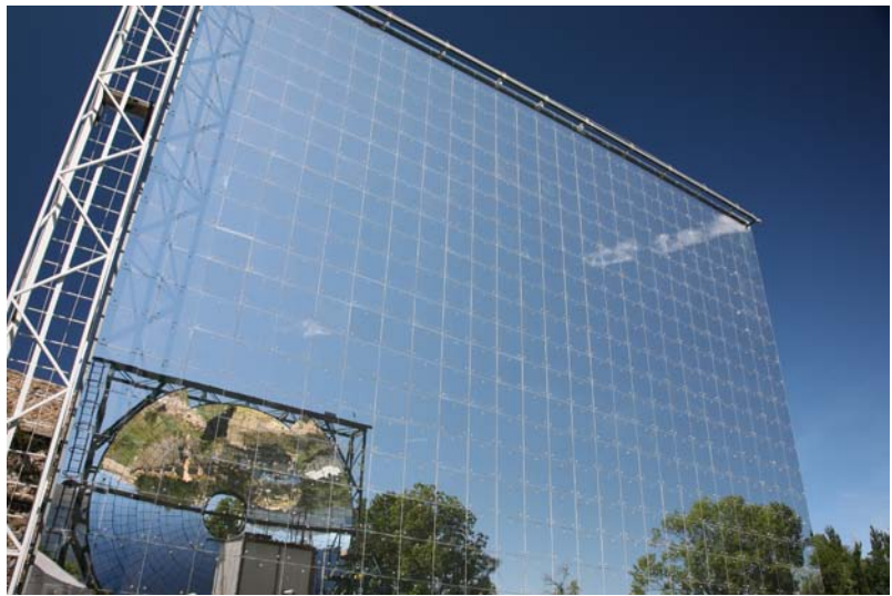
Fig 3. Heliostat facing parabolic reflector. Solar Furnace, Mont Louis, France, 2010.

As the high temperature solar energy research conducted by Trombe and his colleagues related to materials research around nuclear energy and atomic warfare, it was considered to be of military importance. Consequently, the experimental furnace was installed within the ramparts of the 17th century fort at Mont Louis, which still serves as a military base. The fort was designed by Vauban and has been designated a UNESCO World Heritage Site. (Paradoxically, the World Heritage status of the fort is given as a reason to prevent the use of solar panels on the buildings nearby, as these would be seen to interfere with the visual amenity of the fort.)