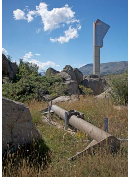
Fig 10. Abandoned heliostat armature. Thémis centre, Targassonne, France, 2010.

Yet the French Government policy of prioritizing nuclear energy with state subsidies offered the owners of the centre, Electricité de France (EDF), more attractive returns on their investment. In 1986 EDF declared the centre 'unprofitable' and closed it, with the plant scheduled to be demolished, the machinery sold for scrap, and the site razed.