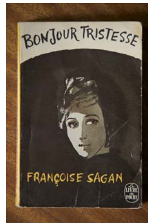
Fig 15. Bonjour Tristesse Paris: Editions Julliard 1964.

Lucid and self-aware, Cécile understands that although the struggle against limitations is a critical aspect of adolescence, the passage to adulthood entails freely chosen responsibility. Torn between enlightened self-interest and self-centred hedonism, she intervenes in the relationships around her. Cécile grasps the psychological dynamics, but underestimates the forces involved. Although the ensuing disaster might have been imagined, it could not have been predicted, lifting the event from a crime to a tragedy.