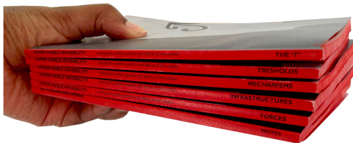
Fig 1 and Fig 2 Booklets that assemble and re-assemble texts by the African diasporas, performing a script which seeks to explore how whiteness functions