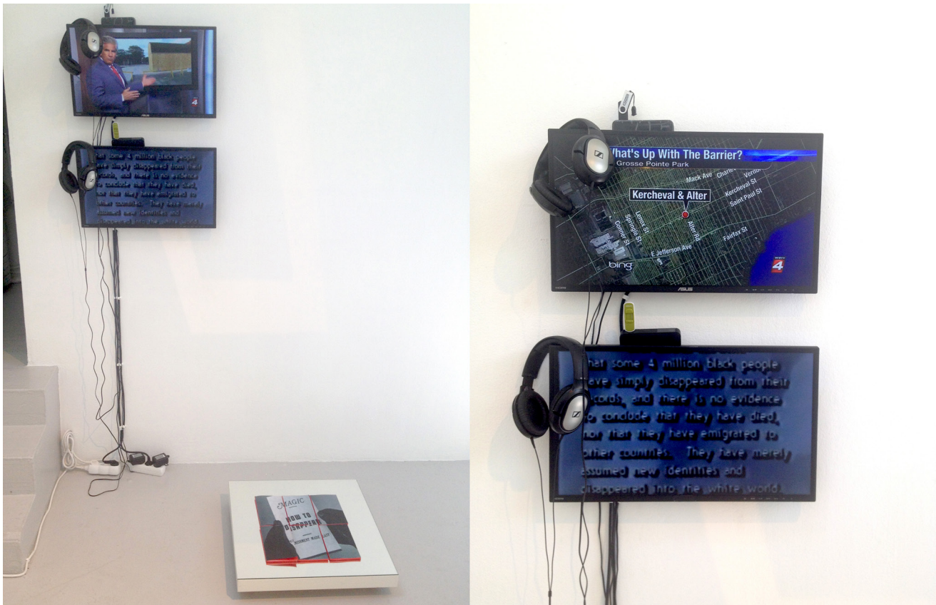
Fig. 4 Video-montage 'Thresholds' that explores how the threshold of race performs and corresponds with the racial spatial divide in Detroit.